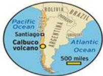
Map of Chile, the Calbuco Volcano has been circled